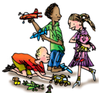
may I play?