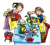
make a cake