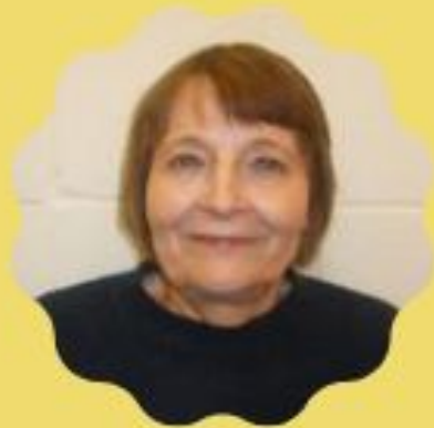
Primrose Gibson Governor