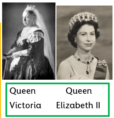
Queen Victoria Queen Elizabeth II