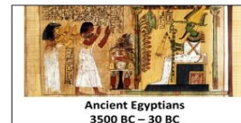
Ancient Egyptians 3500 BC - 30 BC