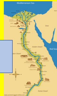
Maps showing Egypt's location