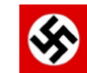
Swastika (symbol of Nazis)