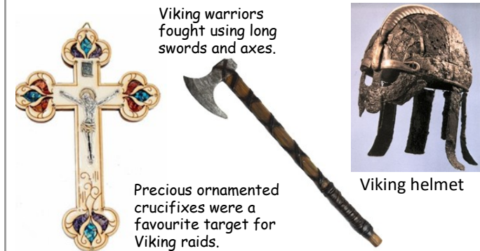
Viking warriors fought using long swords and axes.

This raid caused the Vikings to get a bad reputation. The Vikings saw monasteries and churches as wealthy, undefended and easy targets.