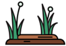
Room to grow