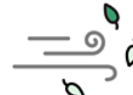
Gases from the air