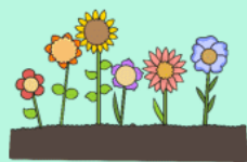
In tall grass and flowers.