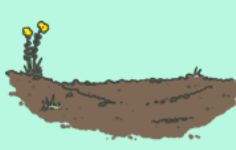
In and on the soil.