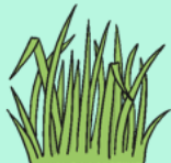
In short grass.