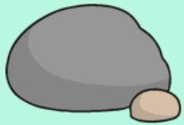
Under stones and rocks.

Here are some different microhabitats you might have found in the local environment.