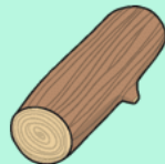
Inside rotting wood.