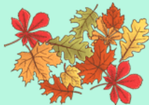
Under fallen leaves.