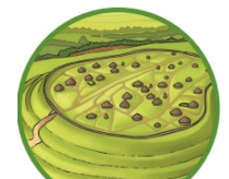
An Iron Age hillfort